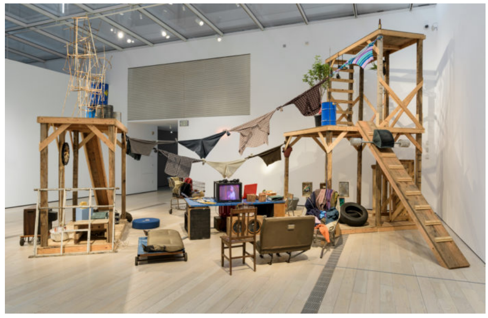
Installation photo featuring Abraham Cruzvillegas's Autoconstrucción , 2010 in the exhibition Home—So Different, So Appealing at the Los Angeles County Museum of Art, June 11, 2017 – October 15, 2017, © Abraham Cruzvillegas, photo © Museum Associates/LACMA

by Andrew Berardini Los Angeles, California, USA 06/11/2017 – 10/15/2017