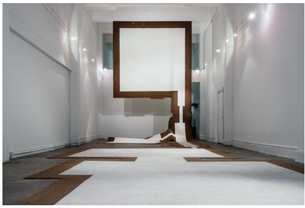
Carmen Argote, 720 Sq. Ft.:Household Mutations – Part B (at gallery G727), 2010. Carpet from artist's childhood home and house paint, 798 1/2 x 178 in.

Books and art and spice and ceramics and furniture. A small sanctuary to share with those I care about. A sanctuary I made with them. A place to work in peace. A room of my own. A room with a view. I can make another.