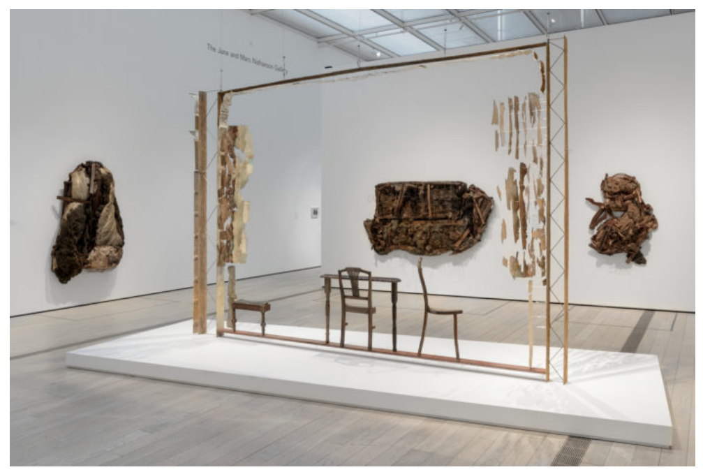
Installation photo of the exhibition Home—So Different, So Appealing at the Los Angeles County Museum of Art, June 11, 2017 – October 15, 2017, photo © Museum Associates/LACMA

And Abraham Cruzvillegas, an artist from Mexico, scraps together a home as he did where he grew up –in a place of poverty you make it yourself with what's a hand– a process he call autoconstruccion that here becomes a rich site of metaphor. In Miguel Angel Ríos video The Ghost of Modernity (Lixiviados) , 2012, shacks scrapped together from rusted corrugated metal and whatever else can be salvaged fall from a sunny sky, one after another, onto a rocky plain. The title hints at the cube as a unit of modernity, and the "ghost" perhaps it's broken down incarnation here. Watching shack after battered shack land on the rocks feels almost funny, a comedy of the absurd. Dorothy's Kansas home tornadoed all the way to this very earthy landscape, but these building are so downbeat, broke down, and just barely held together, and in their ramshackle state they invite a pathos, a whisper of tragedy. Though they could easily be homes by the appearance of woods sheds, here prodding that they are homes hints at a precarity and poverty, a life easily swept away. Modernity even promised to many of its dreamers a promise of relief from poverty and deprivation. And the conditions of many have improved, but too many have been left behind.