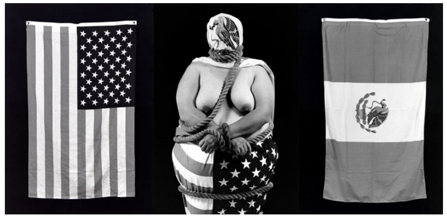
"Three Eagles Flying", 1990. Three Gelatin Silver Prints, 24 x 20 inches each.