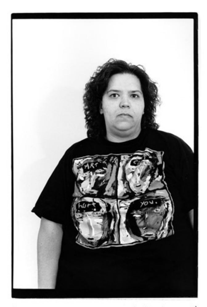
The t-shirt said ART can't hurt you, she knew better. Here problem was she placed a value on it. She believed in it just a little too much she wanted to believe that it was here to have, to hold, and to own.