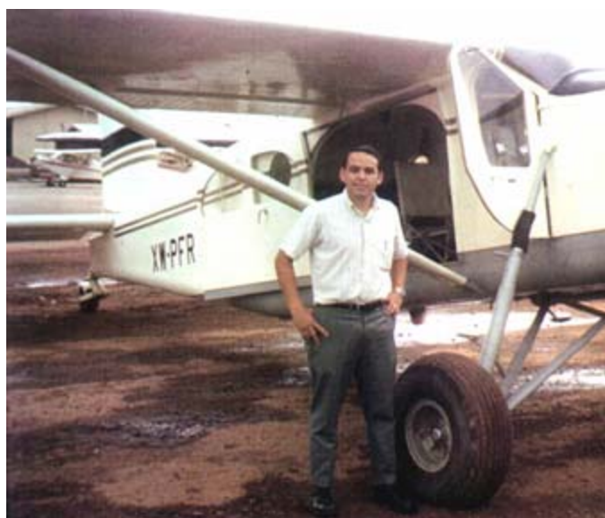
Tony Mendez in Laos in 1968.

When this casting was announced, Hollywood dailies poked a bit of fun at Affleck for casting himself as the star of his own film. They also noted that Bryan Cranston and John Goodman will be co-starring. What the trades didn't mention was that the lead character of Argo , real-life American CIA agent Tony Mendez , is Latino. Affleck is not.