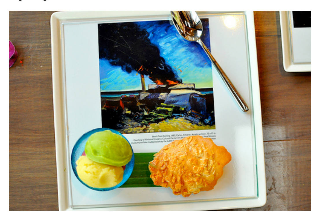
The final "Art As An Appetizer" offering was a simple dessert of sorbet and buttery cookie inspired by Carlos Almaraz's "Beach Trash Burning," which is featured in the "Mapping Another LA: Chicano Art Movement" exhibition at the Fowler Museum, UCLA.

Chicken breast dishes almost always bore me to tears, but this preparation kept me engaged and interested from beginning to end.