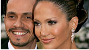
Photos: Celebrity splits of 2011