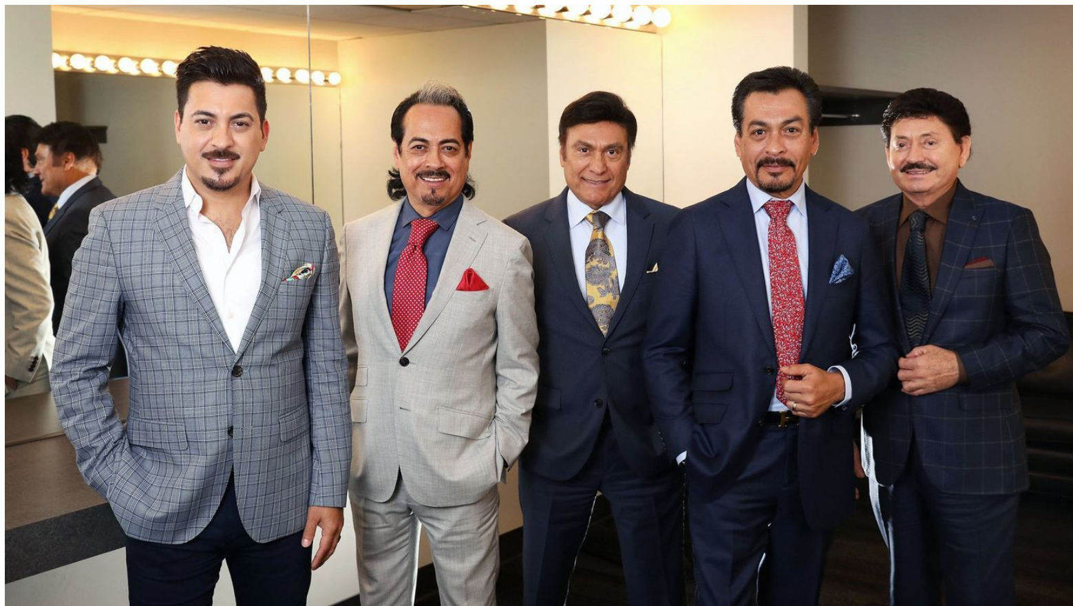
Los Tigres del Norte at the Hollywood Bowl.