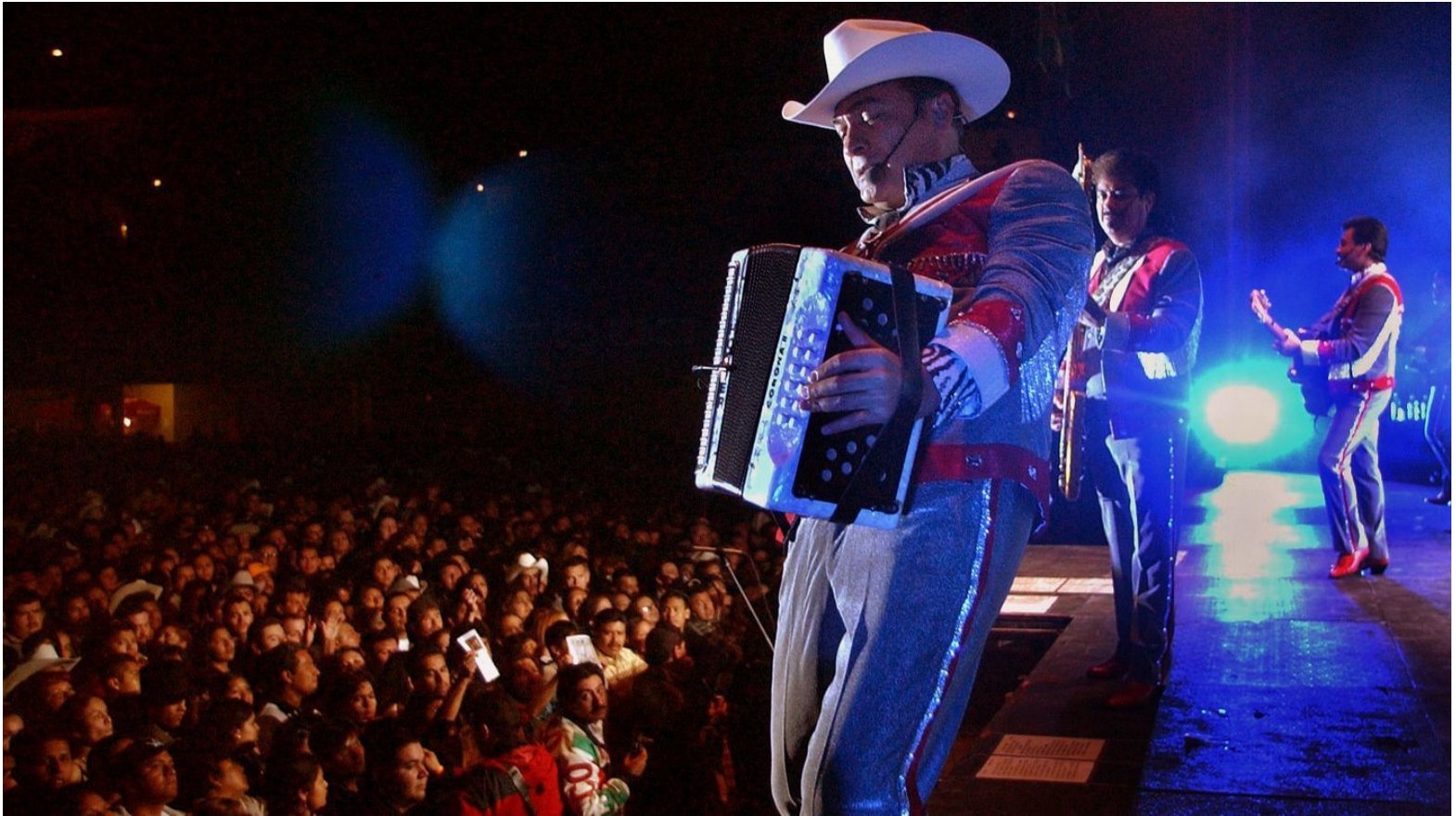
Los Tigres del Norte perform at the Los Angeles Sports Arena in 2002.

It is another little badge of prestige to add to the many that they have already accumulated.