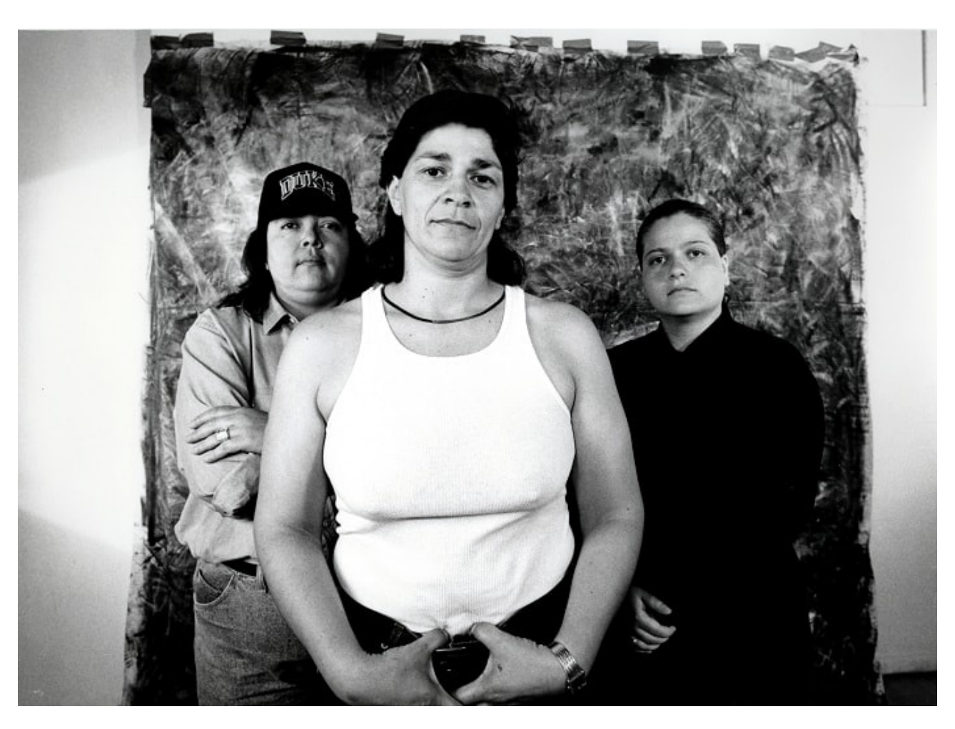
Laura Aguilar, Plush Pony #2, 1992. Gelatin silver print.

The 'three eagles' within the photograph appear implicitly. Her last name, Aguilar, means eagle in Spanish. The national emblems of both the U.S. and Mexico feature the eagle. Her head is wrapped, and her body is bound, to create a forceful political symbol.