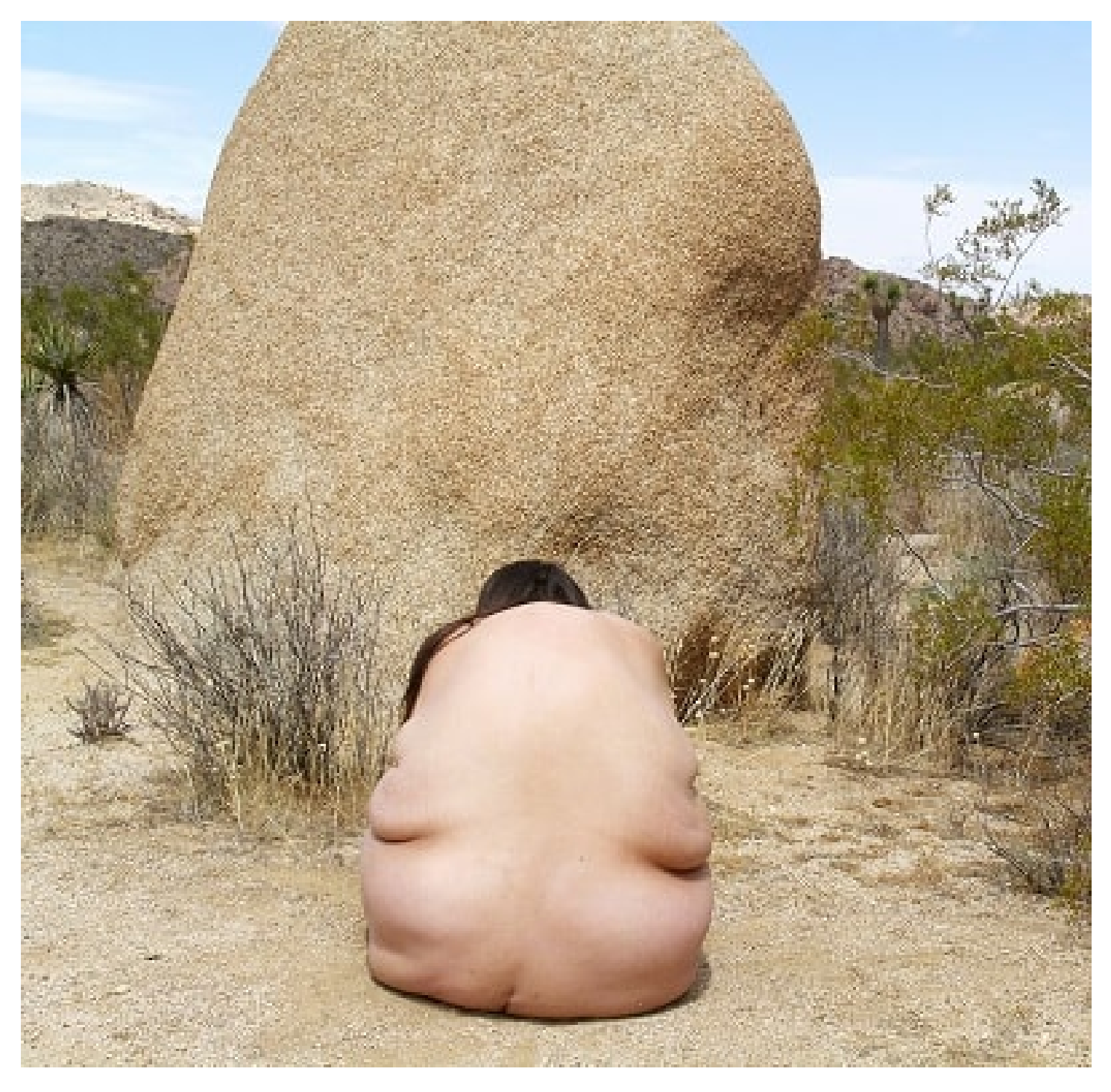
Laura Aguilar, Grounded #111, 2006. Inkjet print. Courtesy of the artist and the UCLA Chicano Studies Research Center.

"Show and Tell" reflects the trajectory of an artist unable to communicate via words, especially due to her auditory dyslexia.