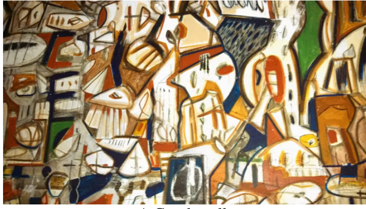
A Gronk wall.

Posted by <u>Daniel Olivas</u> at <u>12:01 AM</u>