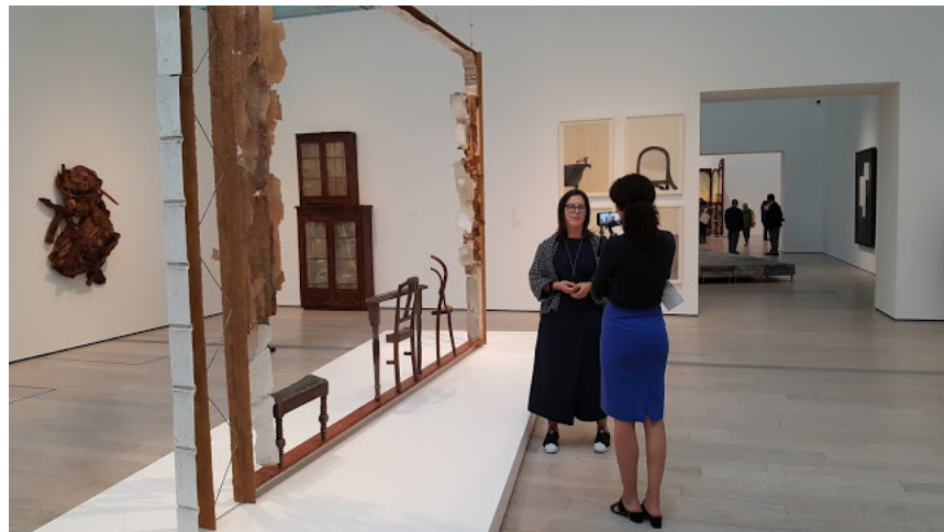
Photograph of one of the exhibit rooms.