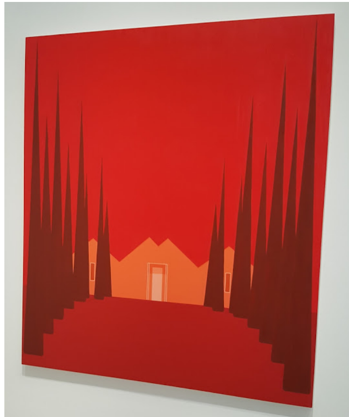
"Untitled House" By Salomón Huerta

Amoxcalli California P Cervantes / KUVO Laila Lalami Latino Storie Los Bloguitc Mujeres Tall New Short F Series - spo Read! Raza The Elegant Tongue and