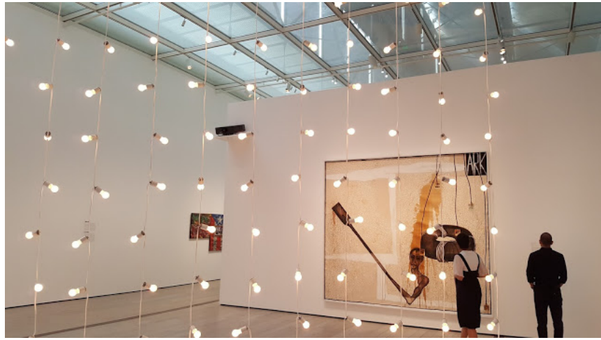
"Untitled" (North) By Felix Gonzalez-Torres