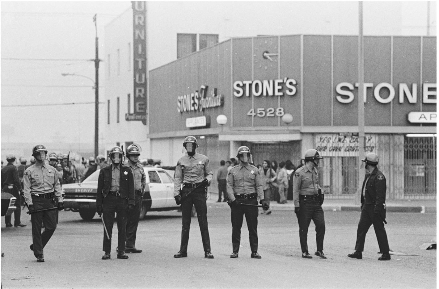
L.A. County Sheriff's deputies assemble at the Marcha por la Justicia (March for Justice) in 1971, from "La Raza" at the Autry Museum. (UCLA Chicano Studies Research Center)

Most significantly, the very nature of the Getty's PST: LA/LA project — with its sprawling exhibition program and its countless curatorial points of view — mean that the art of the continent will not be subject to a single defining conclusion.