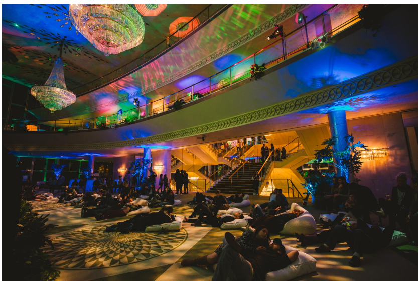
Sleepless: The Music Center After Hours

Tickets: Free and open to the public. More information here.