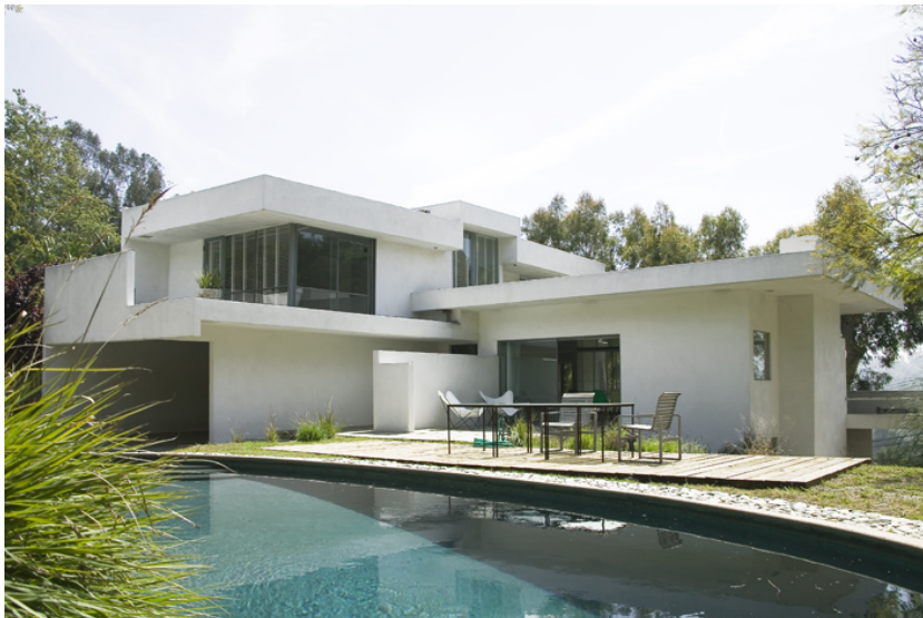
Fitzpatrick-Leland House (1936)

Tickets: Free and open to the public. More information here.