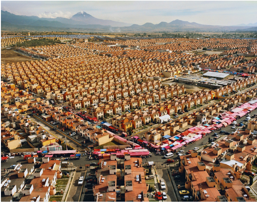
Livia Corona Benjamin, 47,547 Homes , 2009, courtesy of the artist and Parque Galería, © 2009 Livia Corona Benjamin