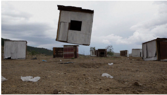
A scene from the video, "The Ghost of Modernity (Lixiviados)" (2012) by the Argentinian artist Miguel Angel Ríos in the show, "Home—So Appealing, So Different"

08/06/2017 09:55 pm ET | Updated Aug 06, 2017