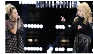
Miley Cyrus And Dolly Parton Team Up With Pentatonix For Stunning 'Jolene' Performance