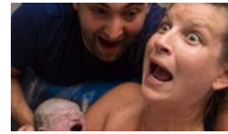
This Is The Face of A Woman Who Just Got A Big Surprise After Giving Birth