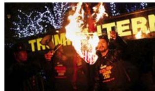
People Burn The Flag Outside Trump Hotel To Protest His Latest Tweet