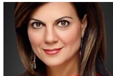
Reporter Quits After 'Downright Terrifying' Death Threats