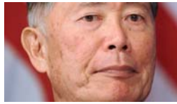
George Takei Eviscerates Trump's Flag-Burning Outcry With One Single Tweet