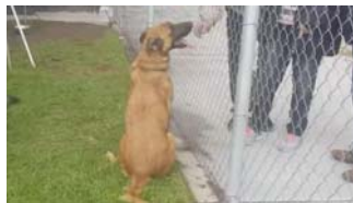
Shelter Dog Watches Her Former Family Arrive To Adopt A New Pooch