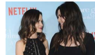
'Gilmore Girls' Actors Defend Against Critics Who Say Revival Is Too Mean