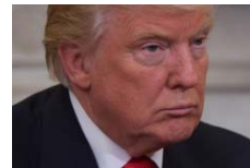
Trump May Not Be Able to Work in the Oval Office for Over a Year