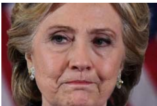
The One Scenario That Could Get Hillary Into the White House