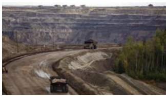
Kellyanne Conway To Visit Canada's Tar Sands, And That Can't Mean Anything Good