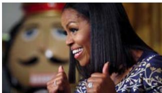
Michelle Obama Exhibits Excellence In Holiday Party Dressing