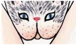
The Vulva Gallery Wants Women To Know That Body Diversity Is Beautiful