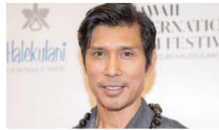
Actor Keo Woolford Of 'Hawaii Five-0' Dead At 49