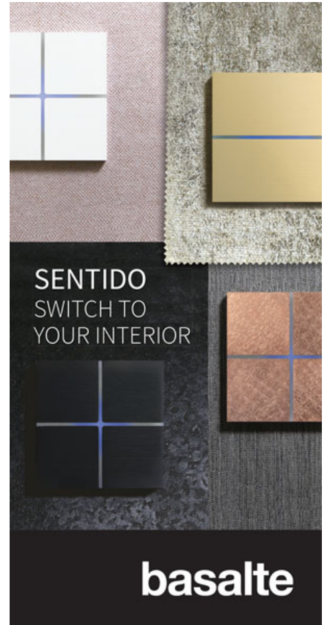
( http://bit.ly/Basalte-Damn-Banner )

Featured here are US Latino and Latin American artists from the late 1950s to the present who have used the deceptively simple idea of 'home' as a powerful lens through which to view the profound socioeconomic and political transformations in the hemisphere. Spanning seven decades and covering art styles from Pop Art and Conceptualism to 'anarchitecture' and 'autocon rucción', the participating artists explore one of the most basic social concepts by which individuals, families, nations, and regions under and themselves in relation to others. In the process, their work also offers an alternative narrative of post-war and contemporary art.