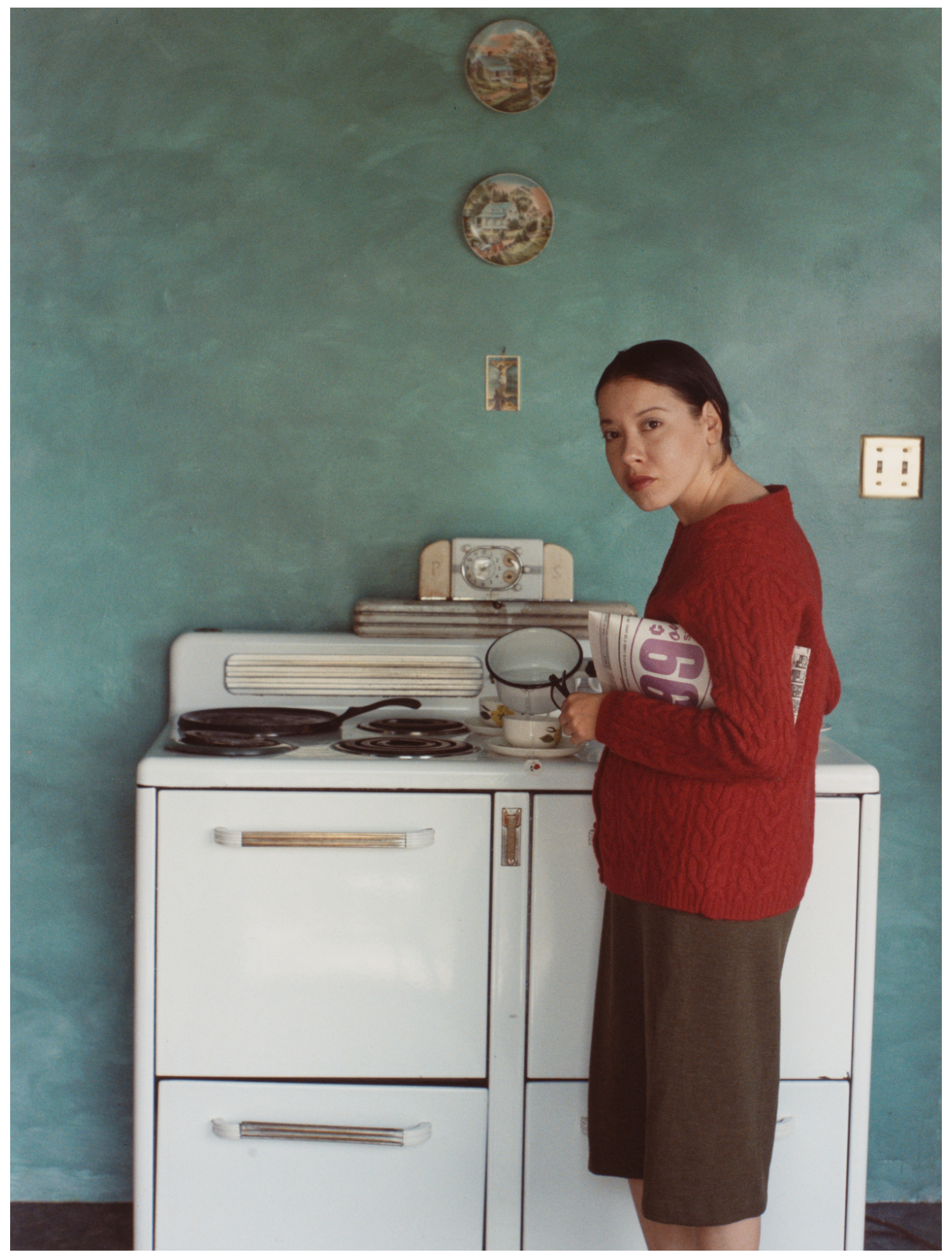
1950, San Diego, California