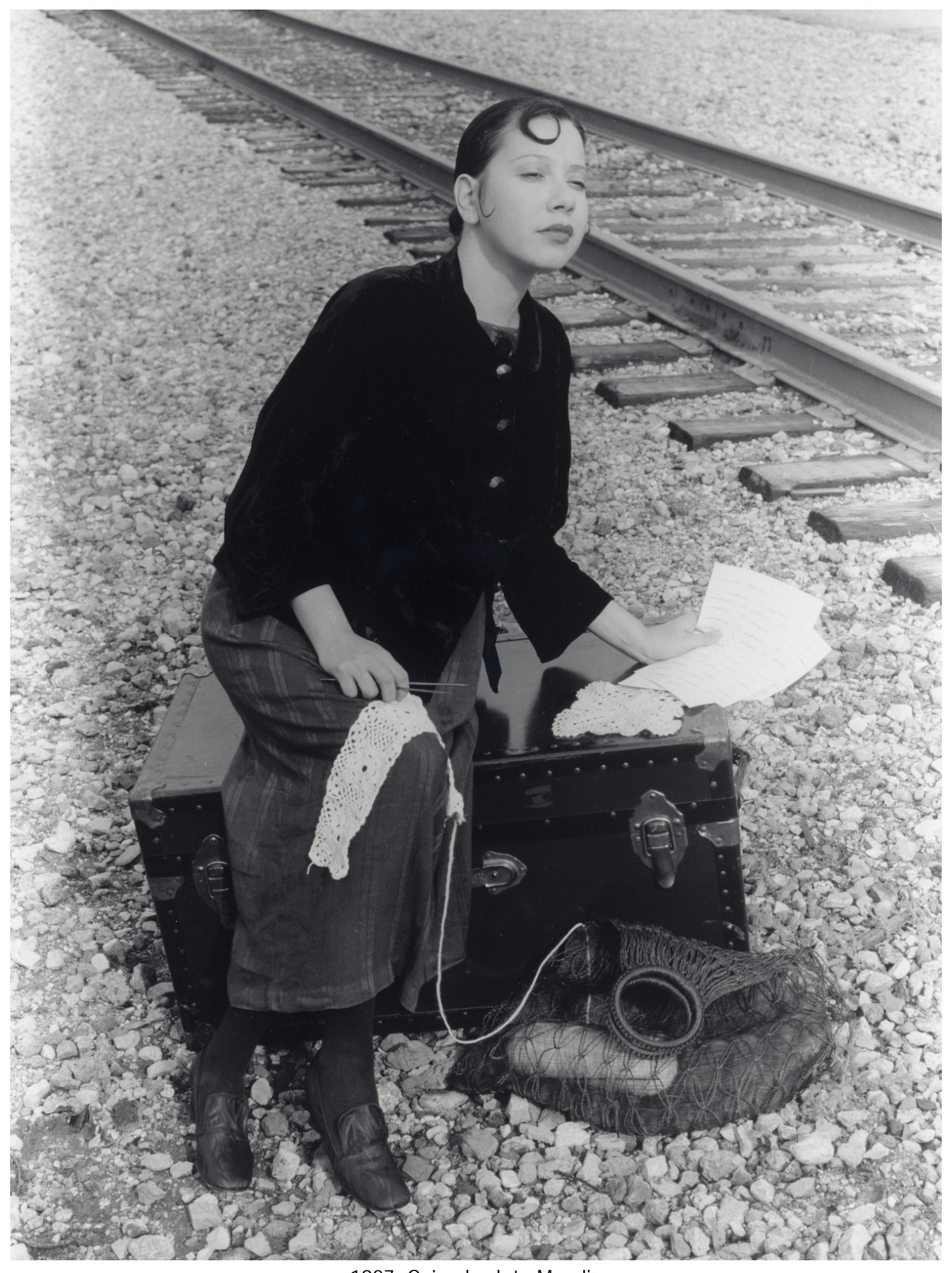
1927, Going back to Morelia