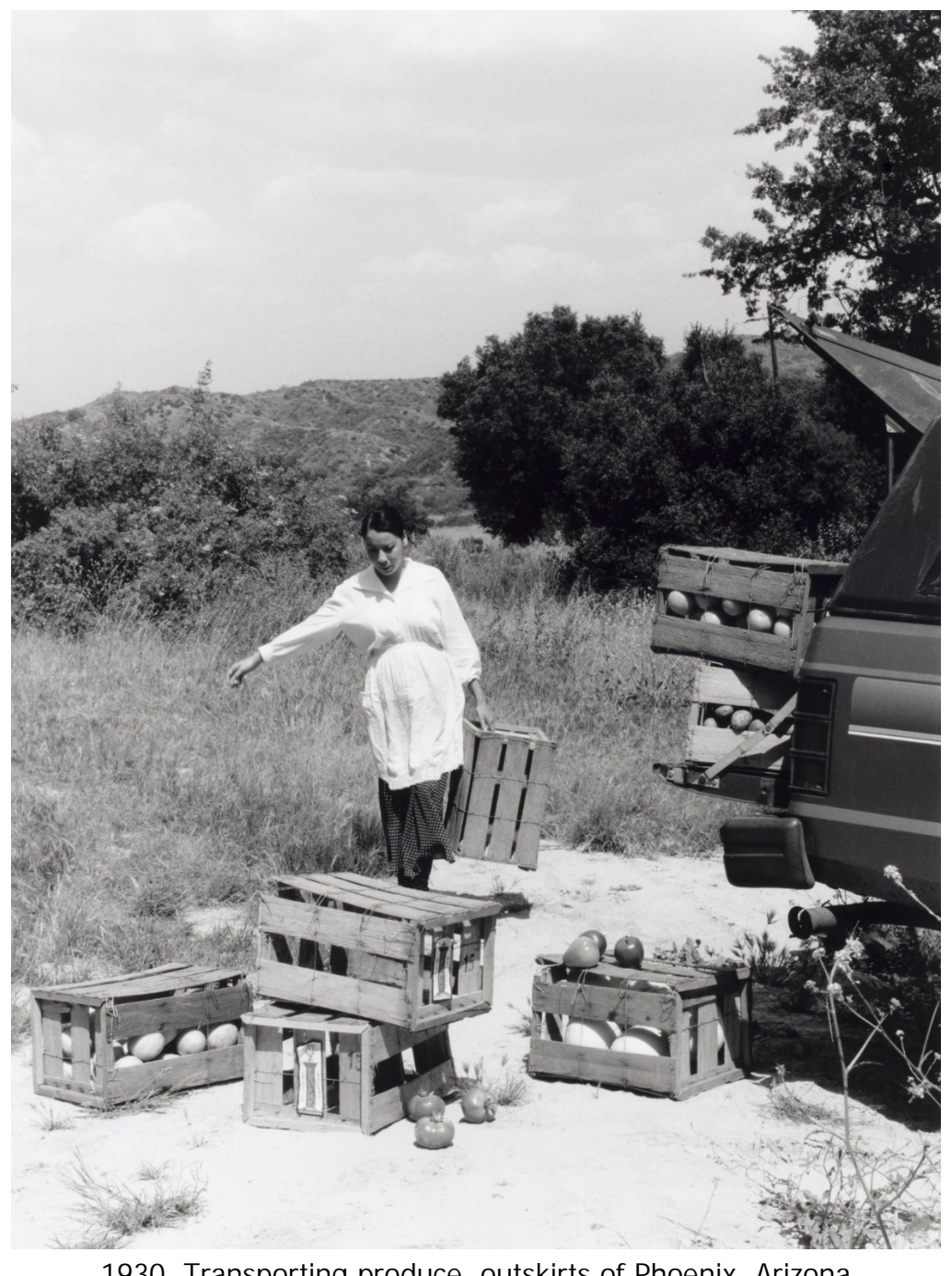
1930, Transporting produce, outskirts of Phoenix, Arizona https://www.moma.org/magazine/articles/75

At the time that I created María's Great Expedition I was not yet a teacher. The teaching would come later. The work attempts to take on the conventions of photographic movements and styles of the time that they are meant to represent, such as Dorothea Lange's FSA photographic style as the look and inspiration for "1930." María's Great Expedition is didactic in the sense that it tells or teaches a story that is rarely or never told in the art museum. It is "educational." Also understanding photographic history and its technological evolution and its effect on the language of the photograph is integral to teaching. So I could say that the development of María's Great Expedition during my last year of graduate school was laying the groundwork for how I now teach.