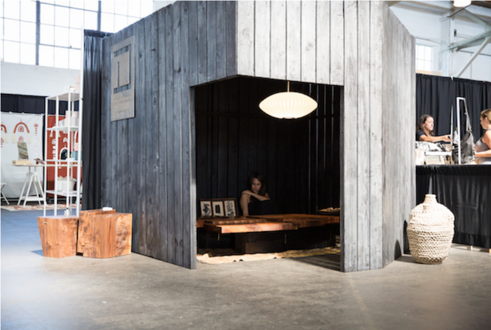
West Coast Craft

Where: Various venues + The Hub, Pier 27, San Francisco