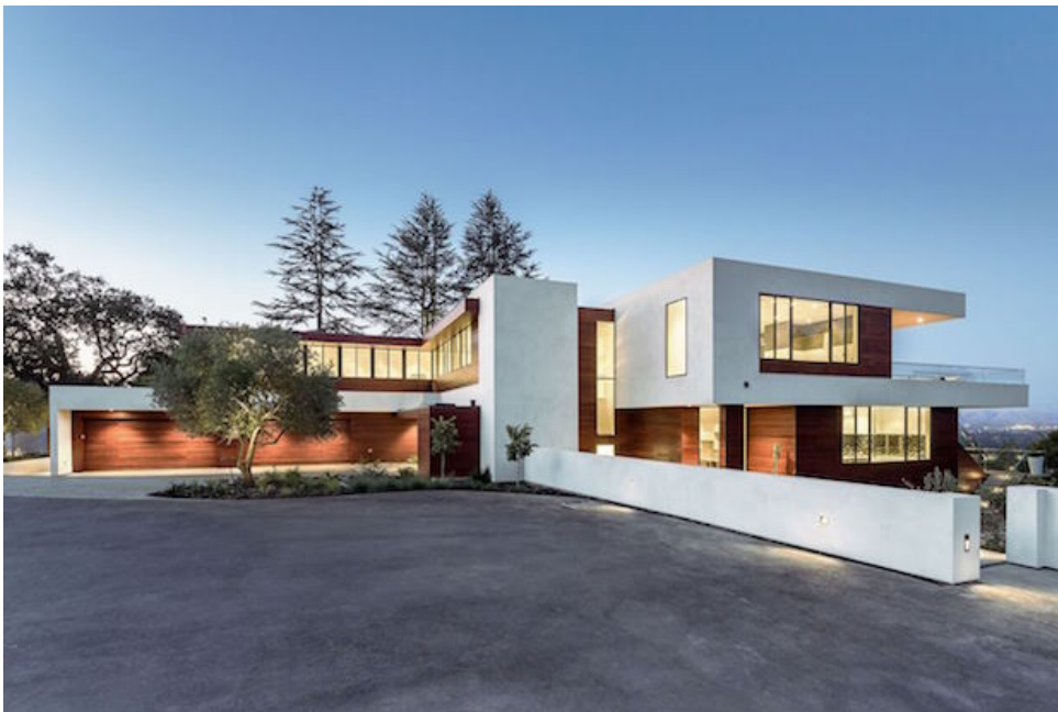
Swatt Miers Architects, Silicon Valley Modern Home Tour