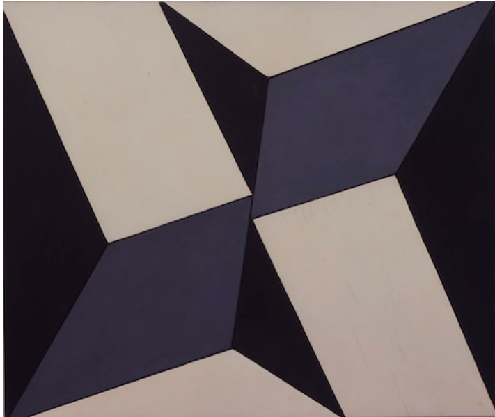
Lygia Clark, Planos em superfície modulada no. 2, versão 01 (Planes in modulated surface no. 2, version 1), ca. 1957, industrial paint on wood. LUIZ PAULO MONTENEGRO COLLECTION.

It's in New York, the center of the U.S. art world, where the topic of Latin American art seems to have been most overlooked. In the last decade, the New Museum has had only one solo installation by a Latin American artist ( Carlos Motta's "Museum as Hub" piece in 2012 ). Over the last eight years, the Whitney Museum has had no surveys that deal with Latino themes and has done only one solo exhibition featuring an artist of Latin American origin . . . sort of. That'd be the 2007 Gordon Matta-Clark exhibition, " You Are the Measure ." (The artist's father was born in Chile.) Even MoMA, home to the current Lygia Clark retrospective, is spotty. Most of its Latin American shows consist of solo exhibitions and installations. In the last decade, the only synthetic exhibitions tied to Latin American art have consisted of works drawn from the collection—such as the small survey of Latin American abstraction shown in 2007 .