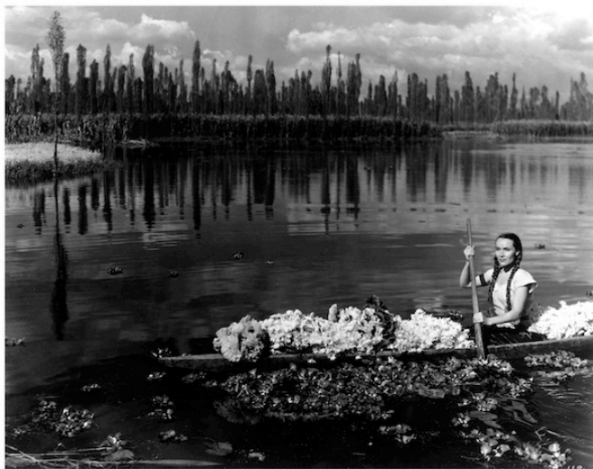
Gabriel Figueroa, still from María Candelaria, directed by Emilio “El Indio” Fernández, 1943.

Some institutions have done more. In addition to the Figueroa retrospective, LACMA has organized a couple of important surveys: one on women Surrealists working in the U.S. and Mexico , the other on art produced after the Chicano movement . Likewise, in the last decade, the Museum of Contemporary Art in Chicago has organized broad surveys on contemporary art in Mexico City and on the Brazilian cultural movement Tropicalía . Both museums have also held numerous smaller solo exhibitions featuring artists of Latin American origin.