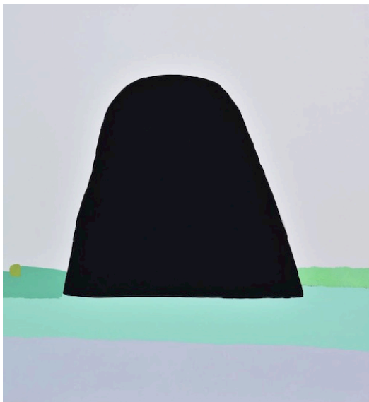
Federico Herrero, Pan de azucar , 2014, acrylic, oil, spray paint, and felt-tip pen on canvas. SOLOMON R. GUGGENHEIM MUSEUM, NEW YORK, GUGGENHEIM UBS MAP PURCHASE FUND COURTESY THE ARTIST. PHOTO: ISAAC MARTINEZ.

The Getty-funded shows join a spate of exhibitions in various stages of execution that also deal with U.S. Latino or Latin American themes. Last year, the Los Angeles County Museum of Art (LACMA) unveiled “ Under the Mexican Sky ,” the beguiling retrospective of influential Mexican cinematographer Gabriel Figueroa . Currently, the Museum of Modern Art (MoMA) in New York has the first comprehensive North American exhibition devoted to the work of Brazilian painter and installation artist Lygia Clark , and the Bronx Museum of the Arts is showing “ Beyond the Supersquare ,” a broad survey that examines the ways in which Latin American artists have dealt with the influences of Modernist design. In Boston, the Museum of Fine Arts provides an overview in the ways that Latin American artists have been in dialogue with their contemporaries around the world. Other exhibitions are also in the works: This week, the International Center of Photography opens an exhibition on six decades of Latin American photographic movements . In June, the Guggenheim Museum debuts “ Under the Same Sun ,” a survey of more than three dozen Latin American contemporary artists from 16 different countries; and next spring MoMA will unveil a major show devoted to the development of architecture in Latin America from 1955 to 1980 .