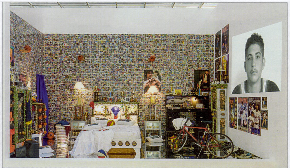
Pepón Osorio. Badge of Honor , 1995. Installation. Variable dimensions. © Pepón Osorio, photo © Museum Associates/LACMA.

breakage, and fracture of our contemporary lives, ideas that acquire great importance and function as a referential framework for our apprehension of the exhibition.