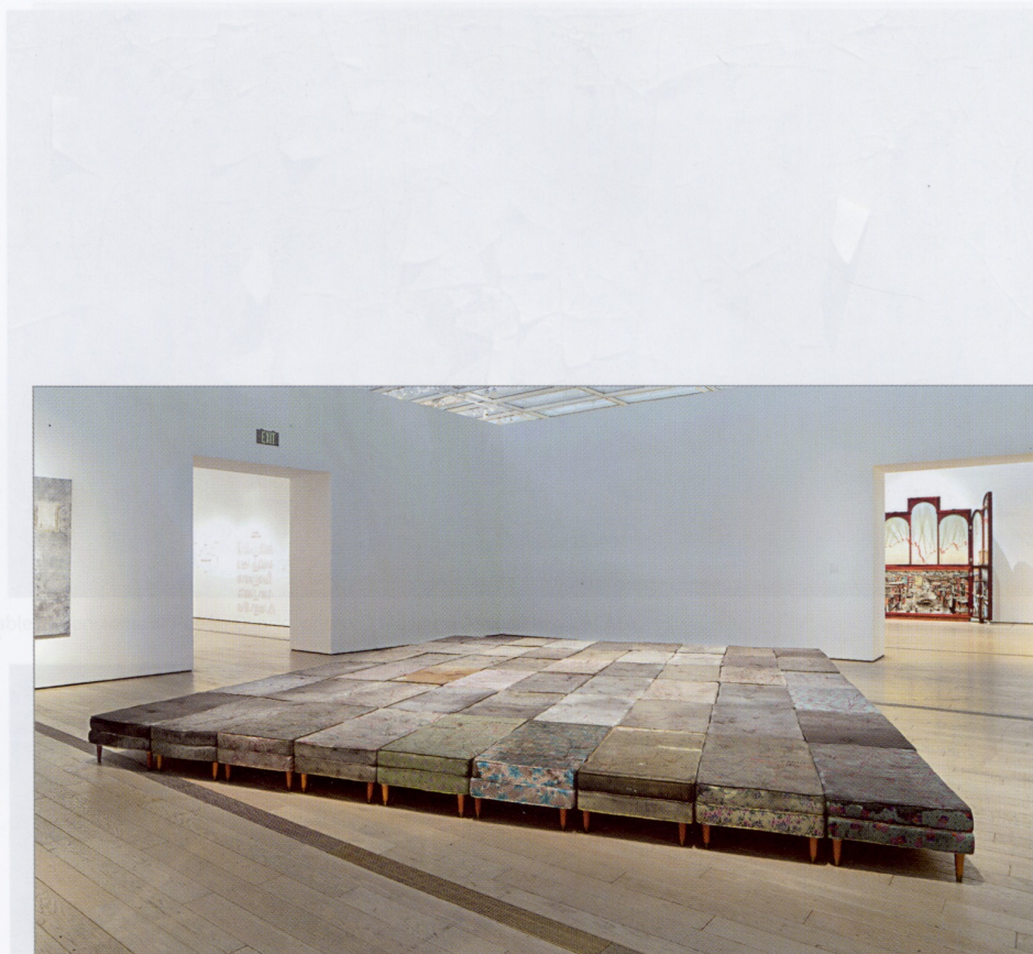
Guillermo Kuitca. Le Sacre (The Coronation) , 1992. Acrylic on mattresses with wood and brass legs. Each: 47 1/4 x 23 5/8 x 7 7/8 in. (120 x 60 x 20 cm).

These works by Martínez are two of the exhibition’s major axes, as they powerfully summarize the notion of home : one from the artifact and the other one from the concept. Between them we find another key work around the idea of home conceived from a critical and political position, one that probably provided Martínez with inspiration: Gordon Matta-Clark’s Splitting (1974), a video in which the artist records how he cut in two an abandoned house using a saw. These three works weave the show’s conceptual grid in terms of the notions of division , displacement ,