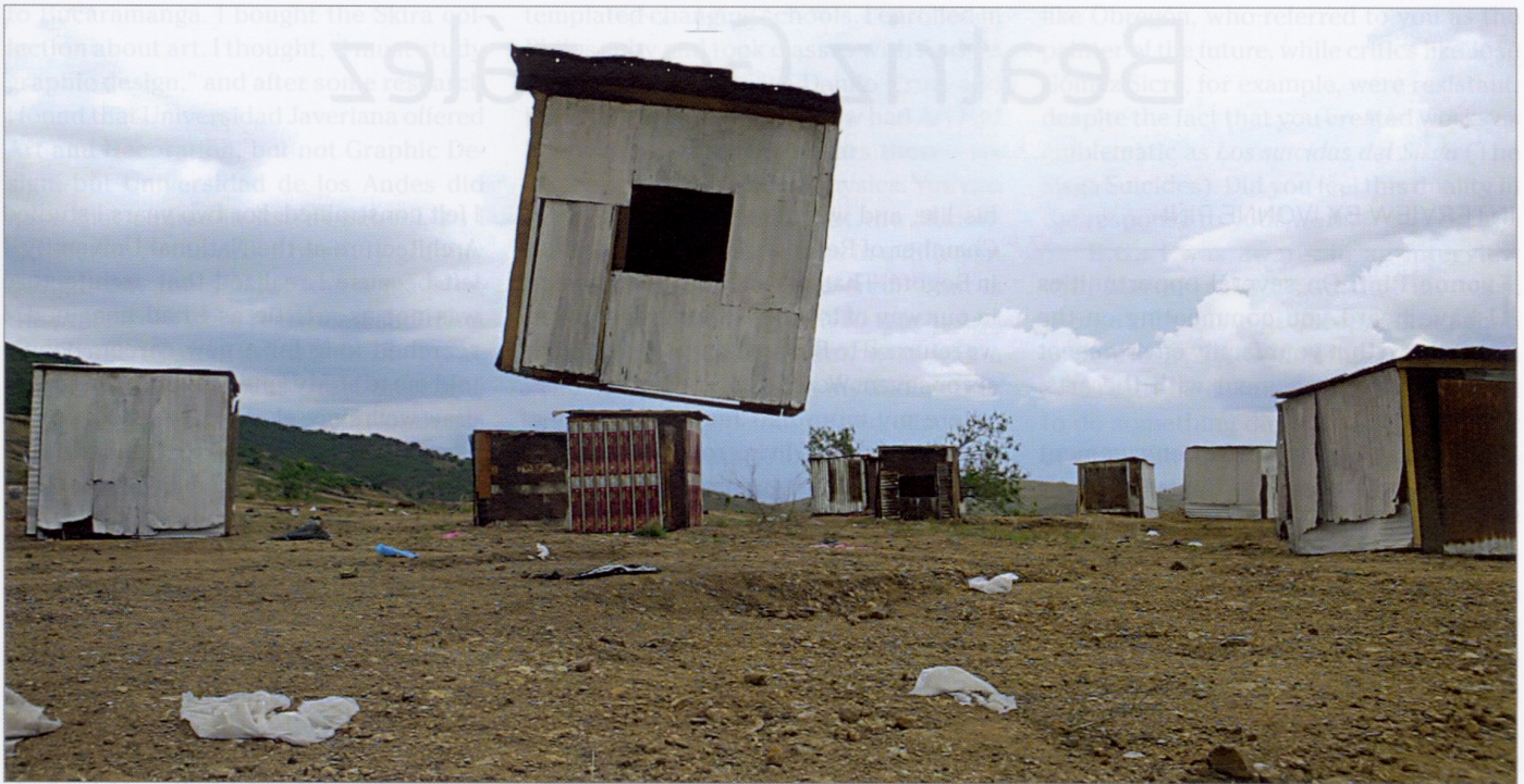
Miguel Angel Ríos. The Ghost of Modernity (Lixiviados) , 2012. Single-channel video. 00:05:02. Courtesy of the artist and Sicardi Gallery, © Miguel Angel Ríos.