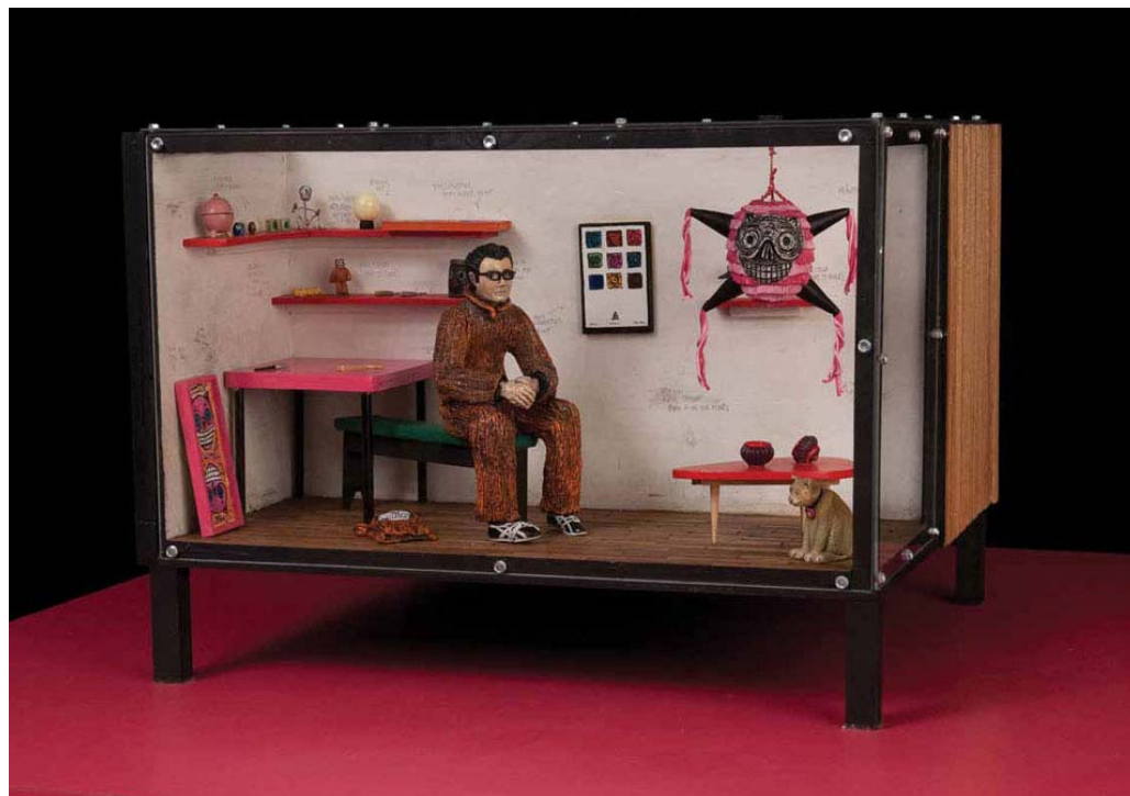
Roy vs. Roy, Roy Wasson Valle, 2005. Polymer clay and other materials, approx: 1 1/2 x 1 1/4 ft x 12-14 in. Courtesy of Michael Perrino.