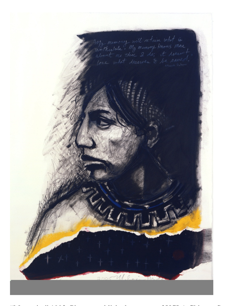
"Memories" 1992.

Montoya produced Memories as part of a collective artistic counter-quincentenary that challenged official celebrations of the "discovery of America" in 1492. In juxtaposing an indigenous portrait with an evocation of the Catholic Church, Montoya mobilized contending formal properties through collage and color, using these to engage the viewers and lead them to the contrasting texts in the image. The first text, in the lower left-hand corner, is the word text itself, suggested by three crosses in which the middle one tilts to the right, forming an "x." This text—with its missing "e"—is an absence that must be remembered: dead bodies, burned indigenous texts, suppressed education for the indigenous, and even the censored Florentine Codex. The second text is the passage by Galeano, the noted Uruguayan writer whose work mixes genres in the same way Montoya mixes media in order to conjure up the memory of the Conquest and its place in the history of the Americas. The irony here is that the passage recalls