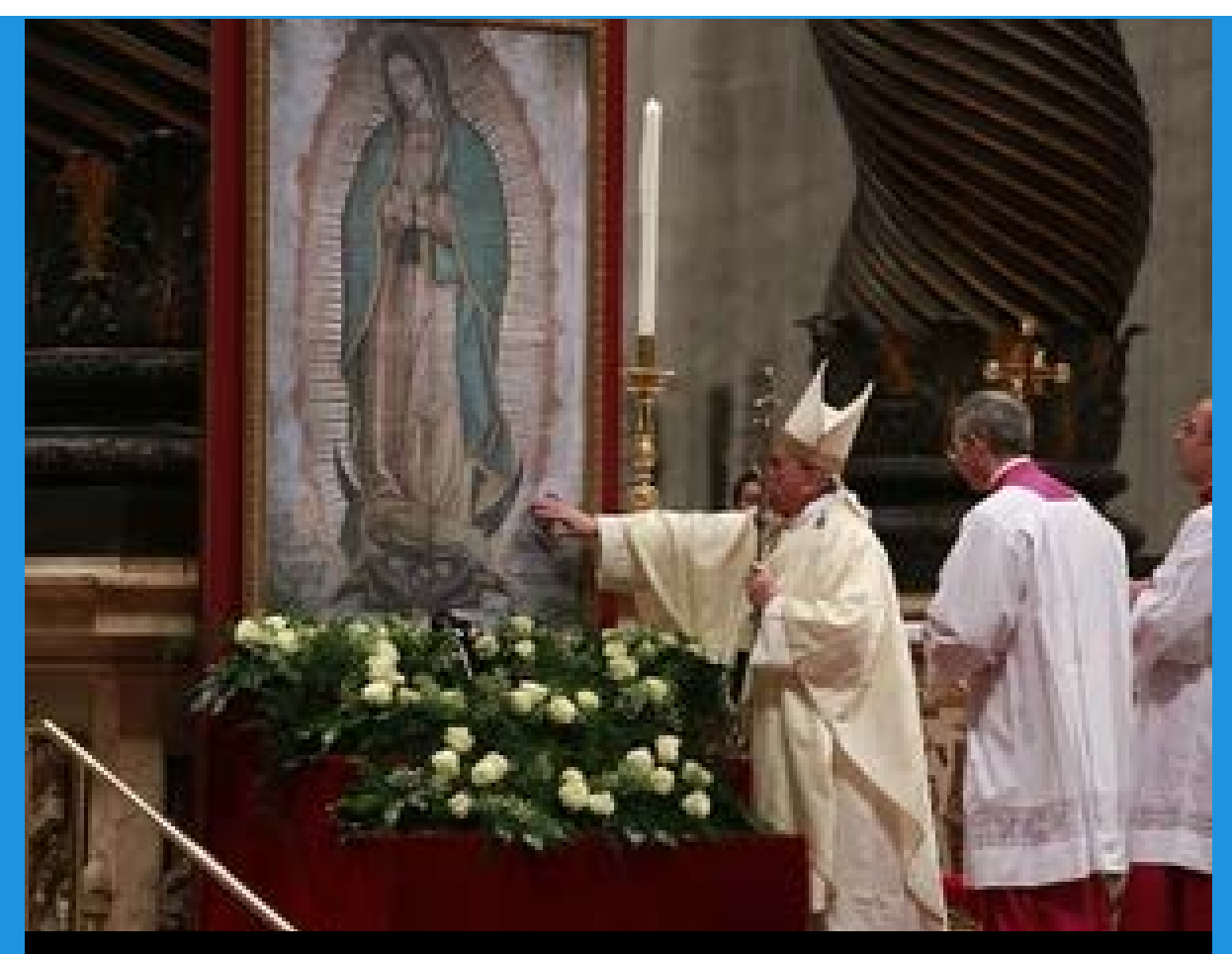
When Pope Francis looks back at Mexico trip, he sees Our Lady of Guadalupe