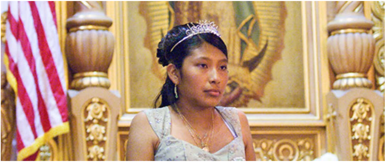
Quinceañeras introduce girls both into society and the Church.