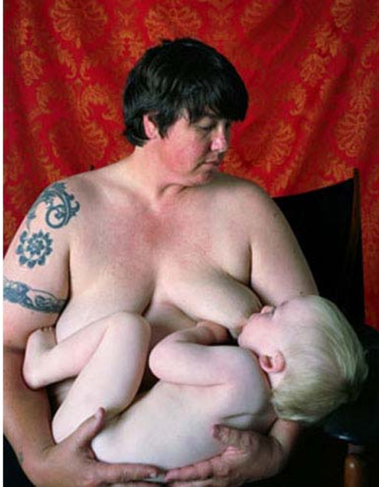
Catherine Opie, Self Portrait/Nursing , 2004, Chromogenic print, 40 x 32 in. Courtesy the artist and Regen Projects.