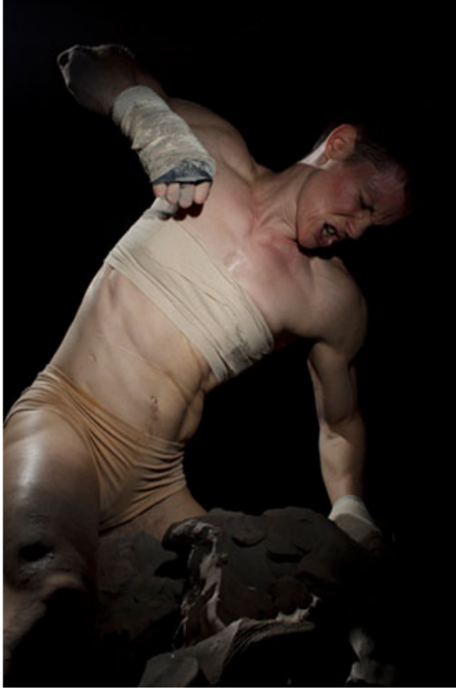
Becoming An Image Performance Still No. 1 (ONE National Archives, Transactivations, Los Angeles), 2012. C-print face mounted to Plexiglas, 45 x 30 in.