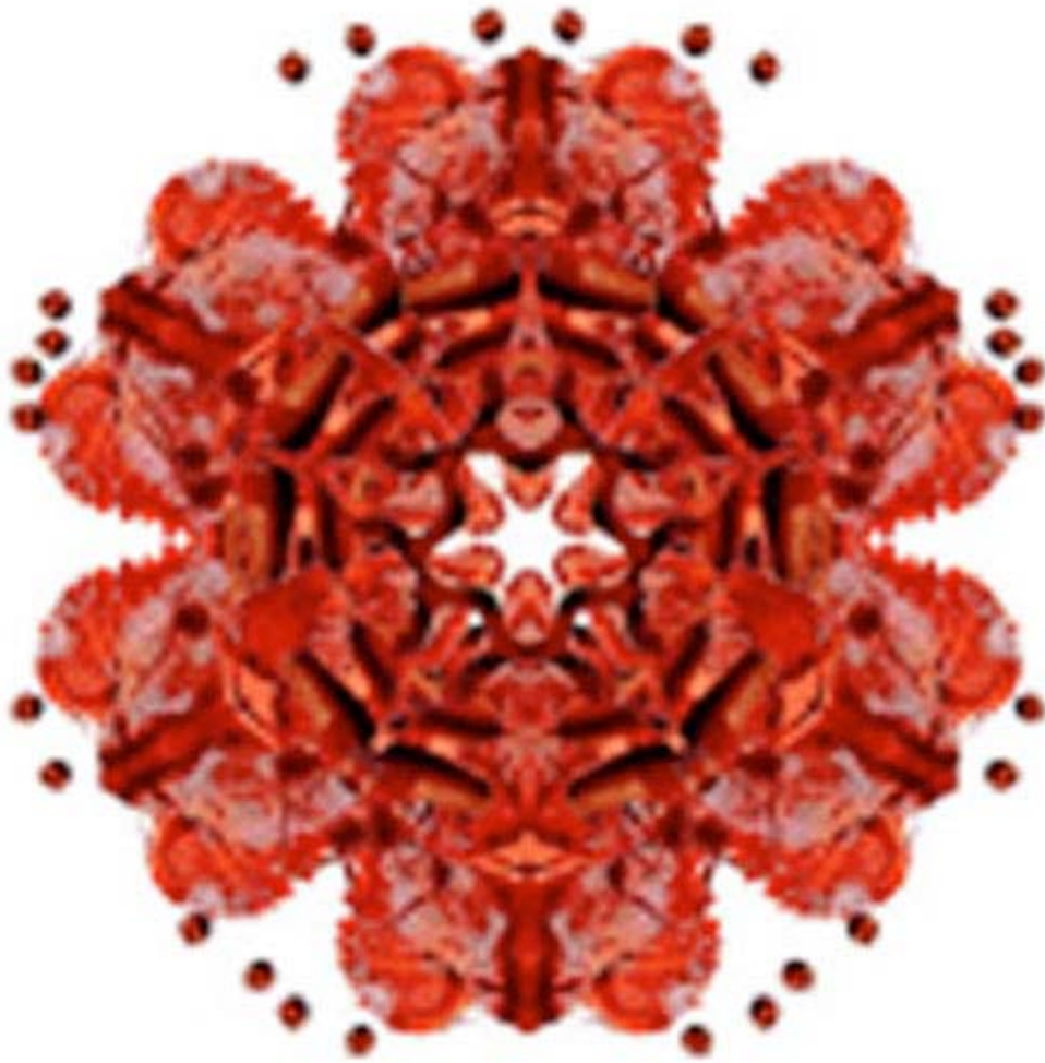
Zanele Muholi, Case 200/07/2007, MURDER (from the series Isilumo siyaluma ). Digital print on cotton rag of a digital collage of menstrual blood stains, 39 x 39 in. Courtesy of the artist and Stevenson, Cape Town/Johannesburg, and Yancey Richardson, New York.