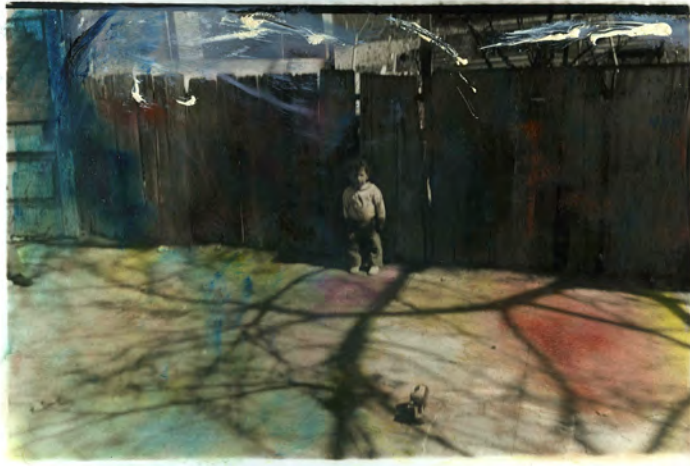
Ricardo Valverde, Esperanza Valverde, 1978. Chromogenic color print, 8 × 10 inches.