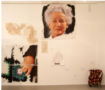
Freeway Lady waiting in studio | Courtesy of Kent Twitchell

exhibitions. "Carlos Almaraz" at Craig Krull Gallery, "Art Along the Hyphen" ( http://www.pacificstandardtime.org/exhibitions?id=art-along-the-hyphen-the-mexican-american-generation ) at The Autry, and the ASCO retrospective at LACMA ( http://www.kcet.org/updaily/social_focus/commentary/movie-miento/1970s-la-chicano-conceptual-art-group-gets-its-due.html ) are showing how Chicano Art may not be in the form of a mural, but certainly has its calling card. Also on view was Millard Sheets' large-scale work for Home Savings and Loans, a tour by Autry National Center's "Art Along the Valley." Within all that is a multimedia mash-up executed by Sandra de la Loza at UCLA in Mapping Another L.A. ( http://www.fowler.ucla.edu/exhibitions/mapping-another-la-chicano-art-movement ), which hints that the Mexican-American mural ( http://www.kcet.org/social/departures/highland-park/painting-the-walls/ ) is ready to take on new forms.