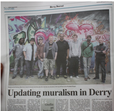
Irish Headliners

Code on Hold: Since a council motion in June--one of many that have been filed in the last few years--the city summoned City Planning to work out an enforceable ordinance that allows murals to be painted on private property. The working draft introduced December 7th is now in public comment period. A public hearing is scheduled for January 10th, and the Planning Commission may consider a new draft in March. For the first time, momentum is on the side of artists. If it is passed, the new mural ordinance will be in the number one position for any possible 2012 list of mural news. A spot is reserved.