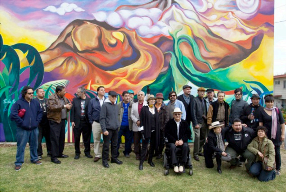
The mural community welcomes back "Organic Stimulus"