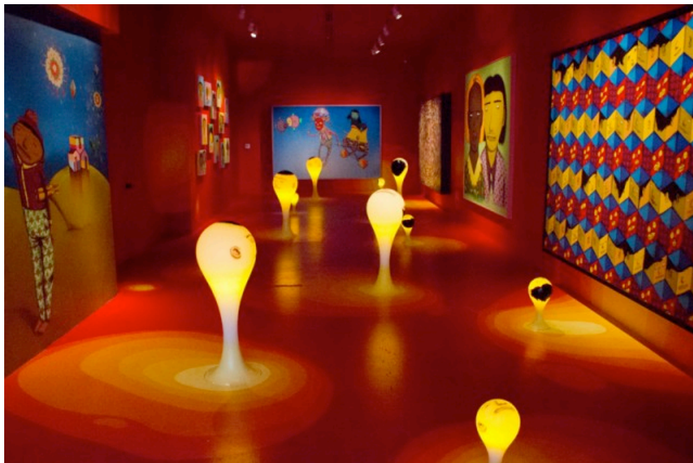
Os Gemeos "Miss You" at Prism

Os Gemeos are Brazilian twin brothers Gustavo and Otavio Pandolfo from Sao Paolo who received a lot of attention from MOCA's Art in the Streets exhibition last summer. Miss You was the brothers first solo show at this gallery. As I entered into the large space covered in red paint, I was pulled into a world of fantasy and magical realism. The exhibition consisted of large-scale paintings and sculptures, giant murals on the walls of the stairway, yellow light bulbs with faces painted on them bulging out of the floors and an interactive projection room that takes you into a surreal dream.