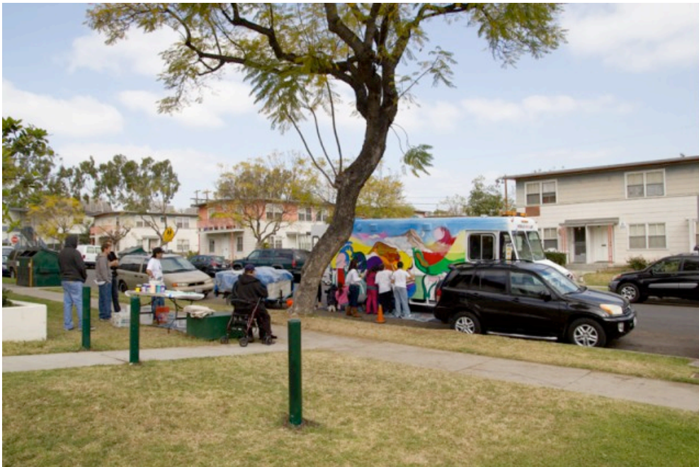
Mobile Mural Lab at Estrada Courts