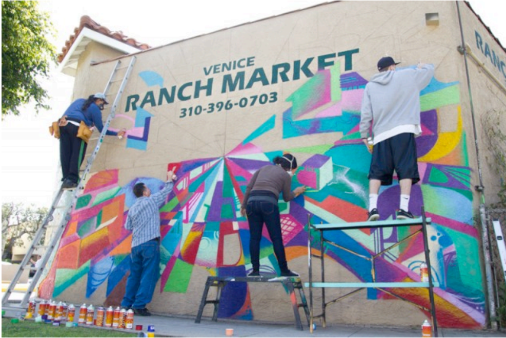
"Chumash" Orozco in Venice