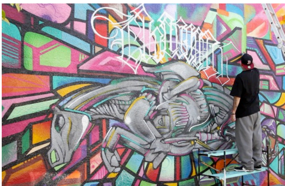
Big Sleeps; Photo by Daniel Lara

Over in West Hollywood at Prism Gallery was a show that has recently ended but received a lot of recognition.