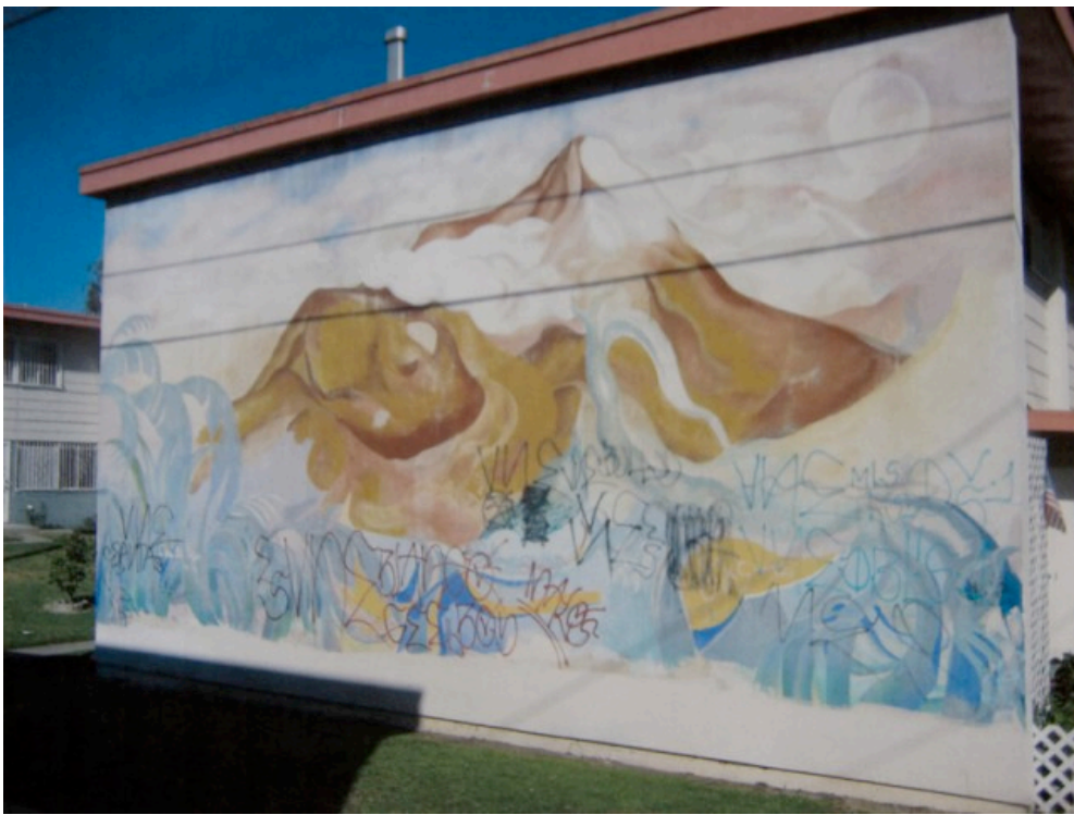
"Organic Stimulus" before the restoration process