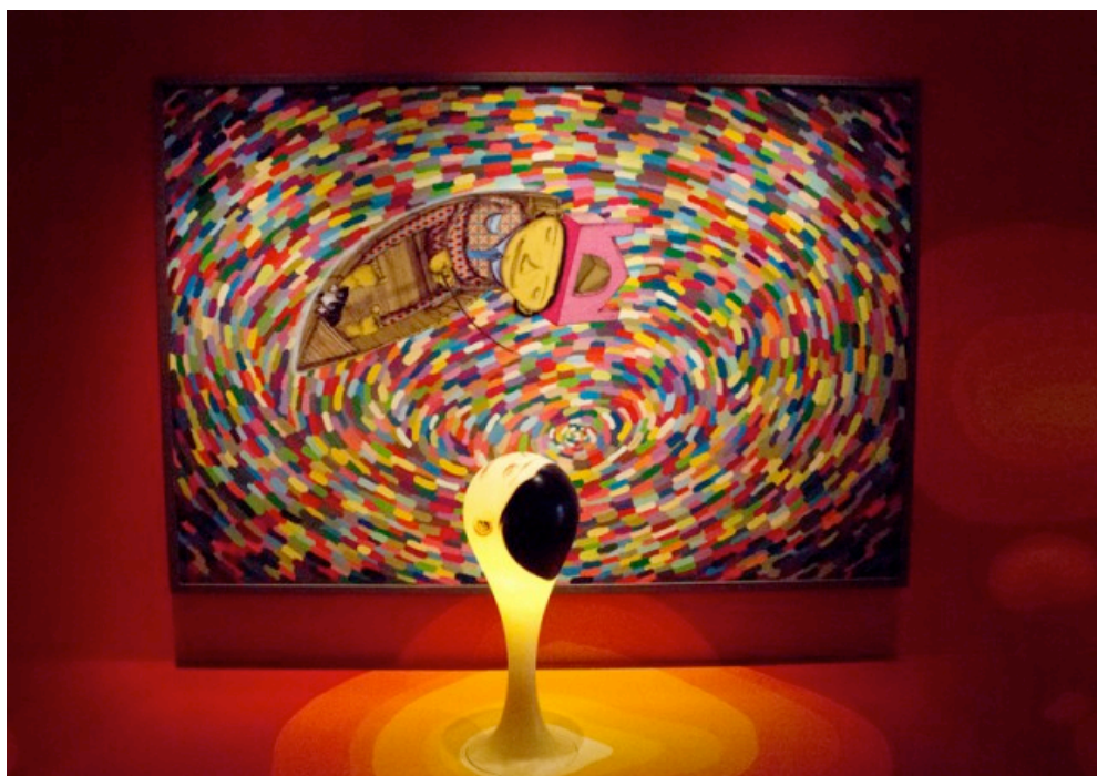
Os Gemeos "Miss You" at Prism