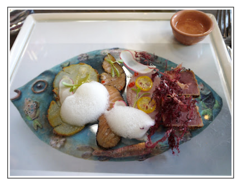
Course 1-Crudo Assortment: A crudo assortment of fresh and smoked seafood with kumquats, fresno chiles, lime, red seaweed, copita of Del Maguey's Chichicapa mezcal. Inspired by Beatrice Wood's "Fish Platter" featured in the Beatrice Wood: Career Woman-Drawings, Paintings, Vessels, and Objects exhibition at the Santa Monica Museum of Art.

This drink is an inspired margarita, an East-side sipper to chill out the homies como puro relax .