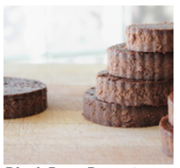
Black Bean Brownies by: Scarletta Bakes