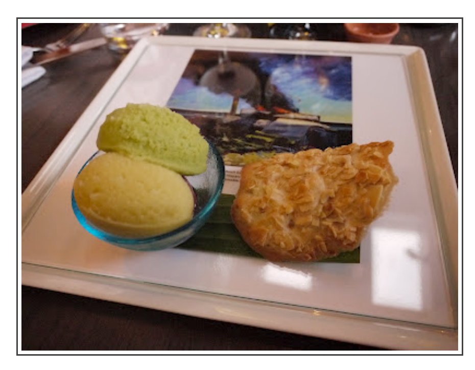
Course 3- Beach Trash Burning: Sorbet splashes of roasted pineapple mescal, poblano chile lime, hibiscus pomegranate. Inspired by Carlos Almaraz's 1982 "Beach Trash Burning" in the Mapping Another LA: Chicano Art Movement exhibition at the Fowler Museum, UCLA.

Outstanding chicken dishes are coming out of Sedlar's kitchens these days and this is no exception. It's Burnin' Down the House good.