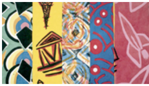
2010 in review: Christopher Knight on art