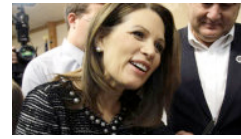
Bachmann: 'I don't hate Muslims'