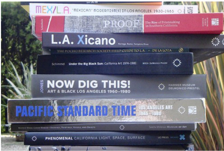
Pacific Standard Time catalogs.

Comments 1 Share 199 0 Tweet 15 Recommend 51