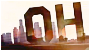
Pacific Standard Time