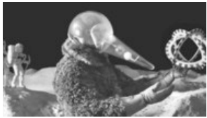
Art and science collide at Pasadena gallery