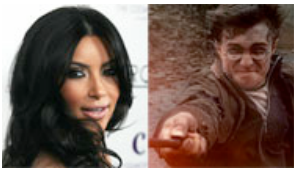
Photos: Entertainment Hits & Misses in 2011