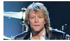
Bon Jovi jokes about death reports

One is what I think of as the inadvertent shopping list. While visiting PST exhibitions at venues large and small, I've been