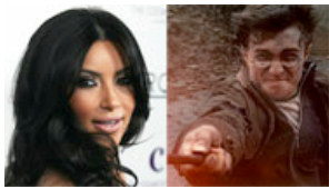
Photos: 2011 Entertainment Hits & Misses