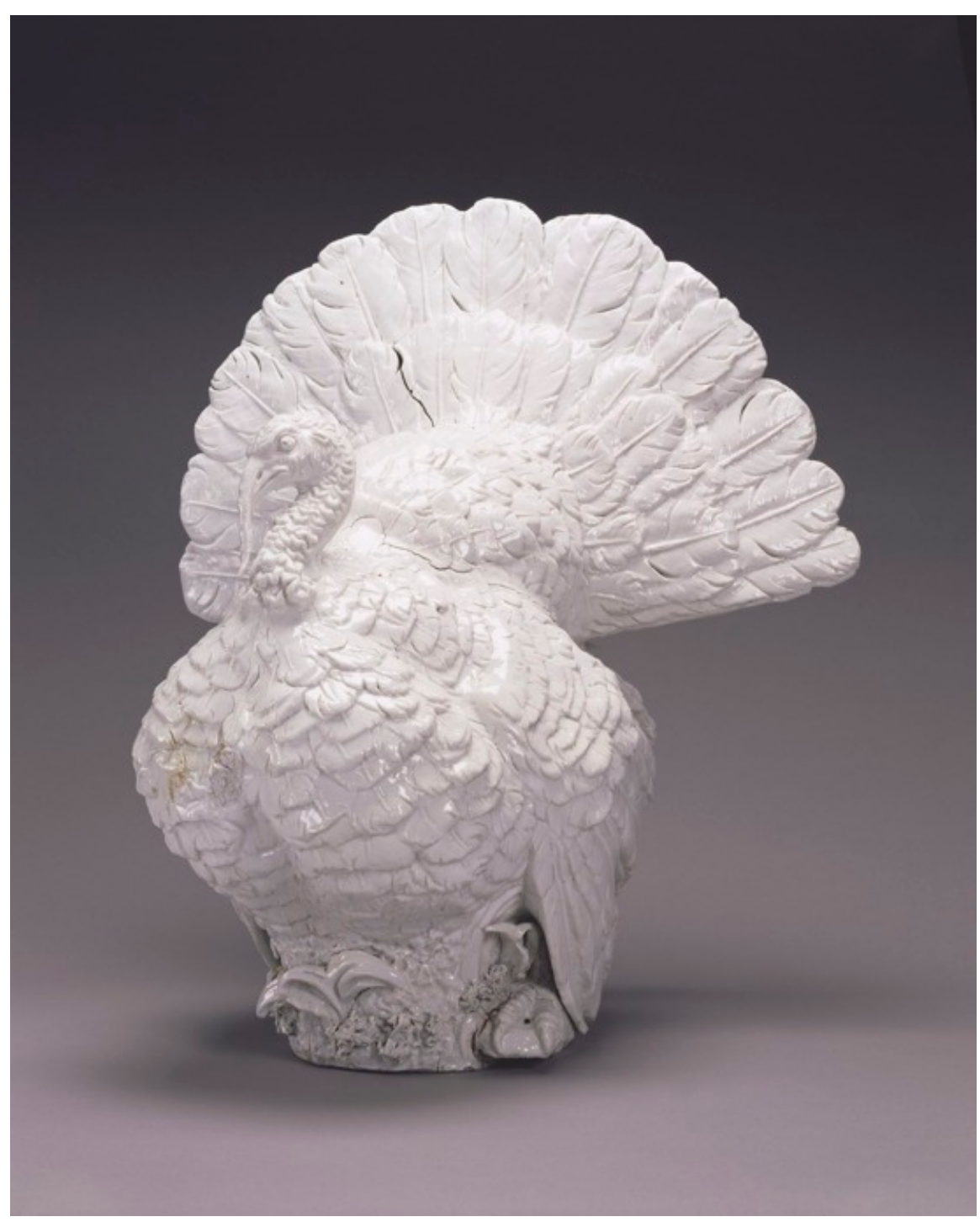
The J. Paul Getty Museum, Los Angeles