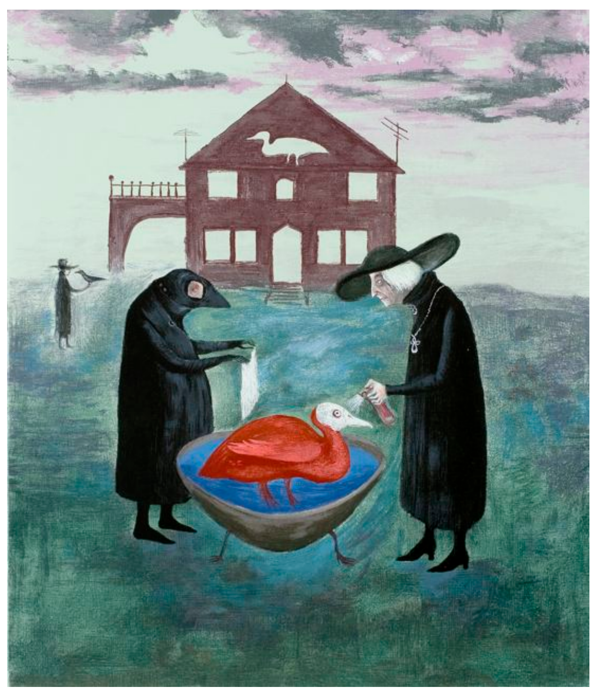
Museum of Latin American Art, Robert Gumbiner Foundation Collection