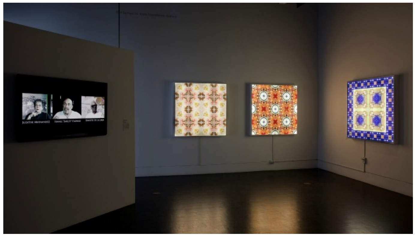
Still life with murals from LACMA's Sandra de la Loza installation

The real-life physical presence of the chair itself in this scenario, the fetishization of the actual object that serves as the film's primary prop, does feel very LA. And it's striking, too, to recognize how few--actually none--of the elements in these projected images looks or feels even slightly dated. This 44-year-old work could easily have been made last week.