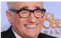
Oscar voters snub Aussie actors